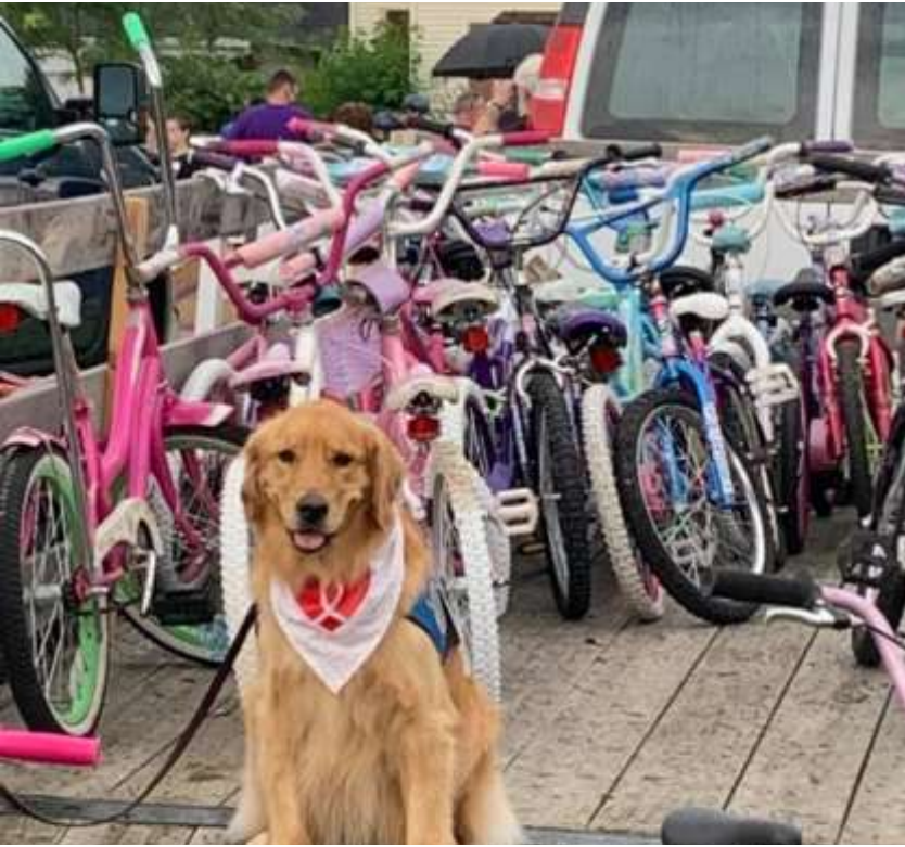
Mary Comfort Dog helping with the bike give-a-way